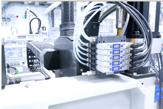
Compact terminal SCTMi for vacuum generation when removing injection molded parts